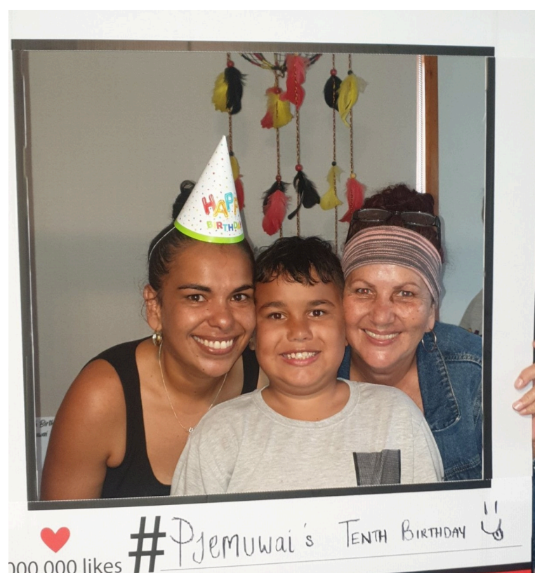
100,000 likes ❤️ #Pjemuwai's TENTH BIRTHDAY 🥳